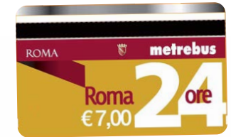
Metrebus 24 hours € 7.00