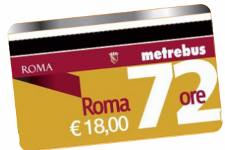
Metrebus 72 hours € 18.00