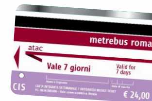
Weekly pass (CIS) € 24.00