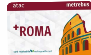
MULTIBIT €3.00 – €15.00