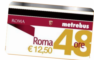
Metrebus 48 hours € 12.50