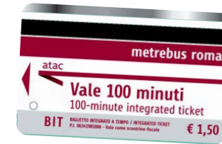
One-way ticket (BIT) € 1.50